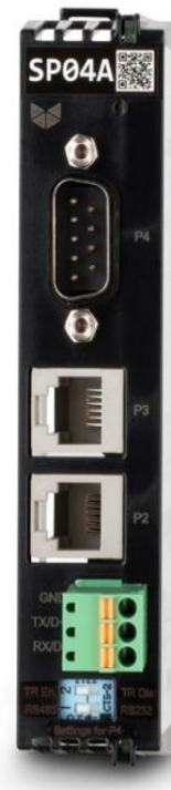
Figure 1: Front view of the SP04A module